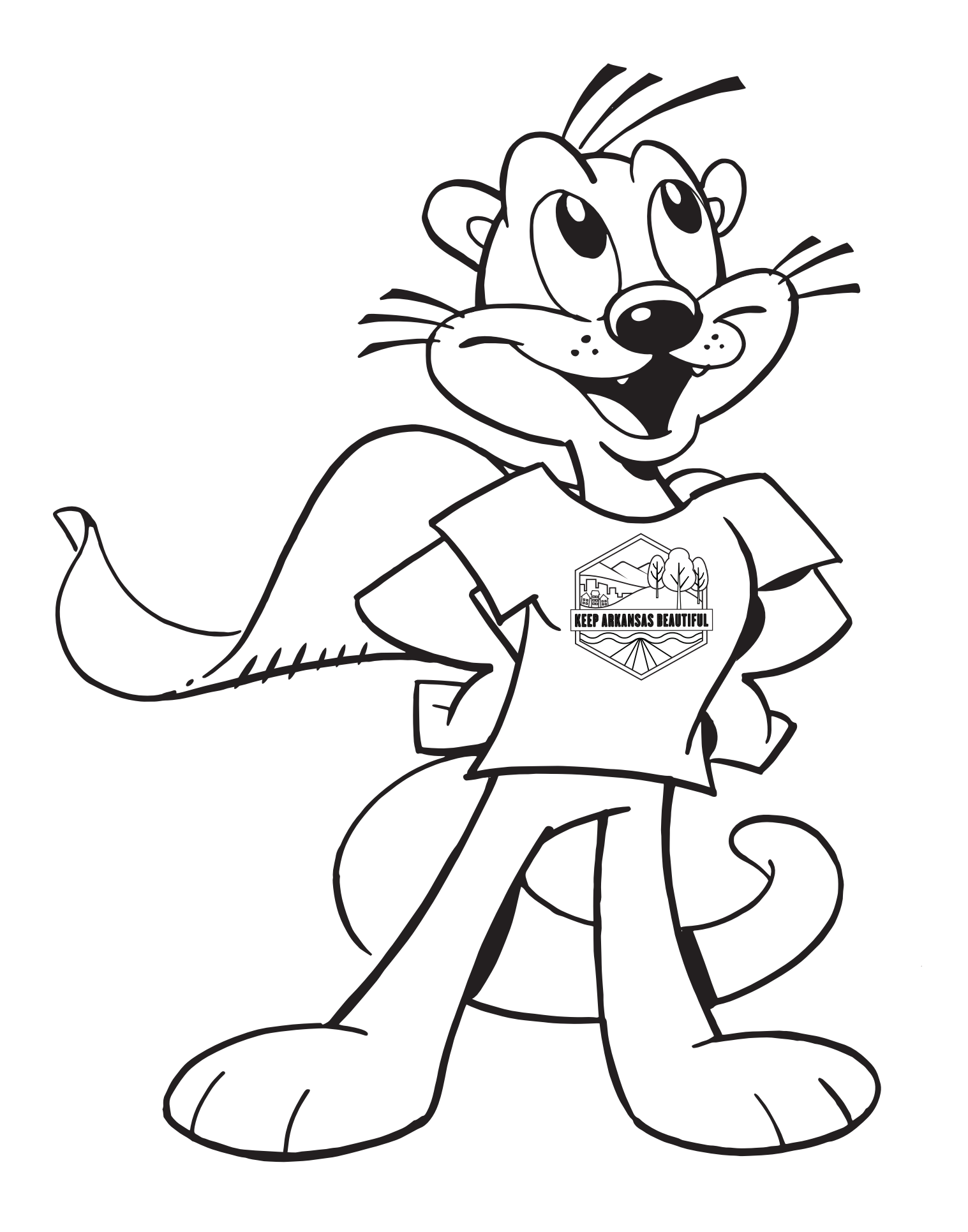
Be a Superhero – Keep Arkansas Litter-Free