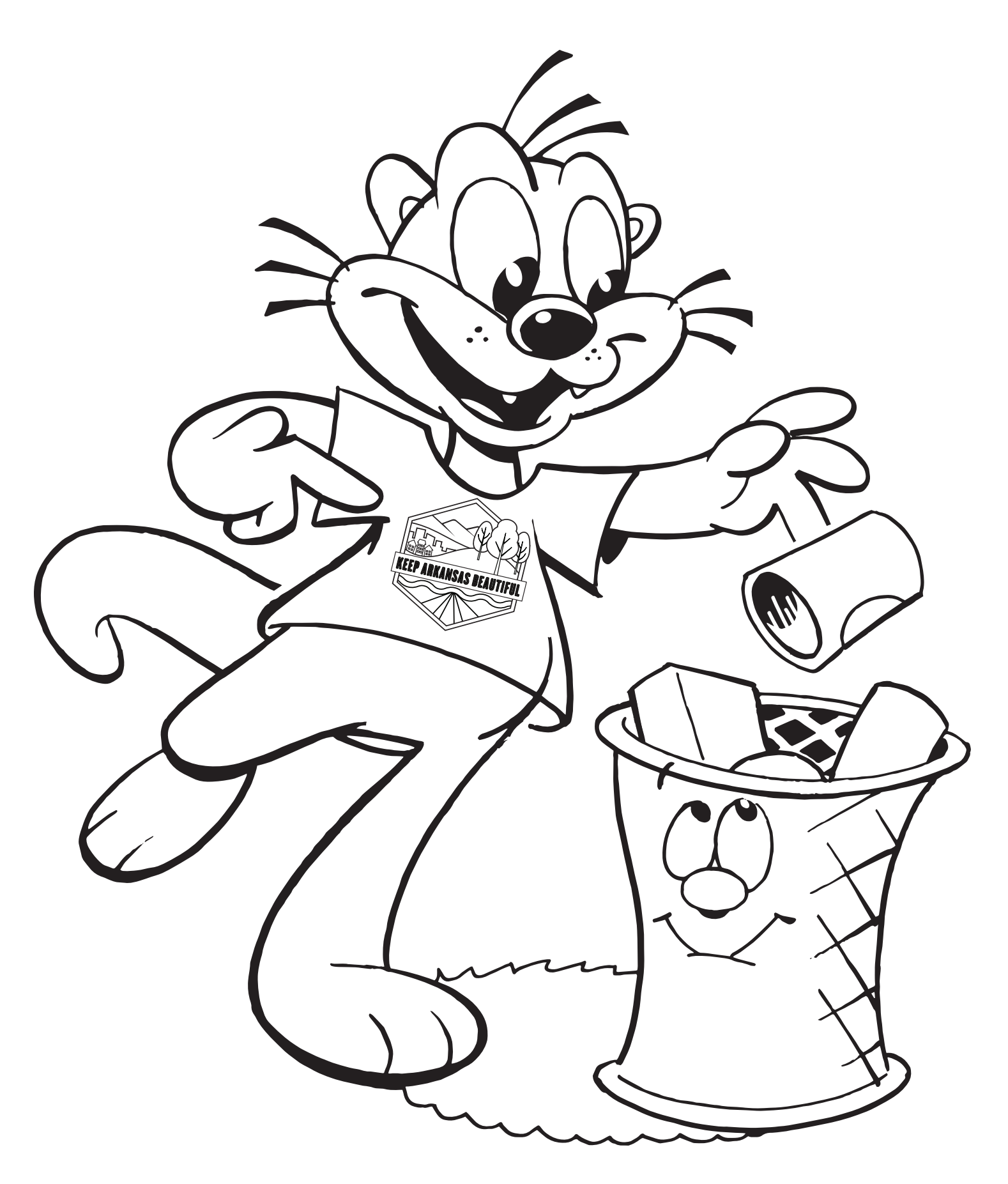
Do your part. Pick up litter and put it in the trash!