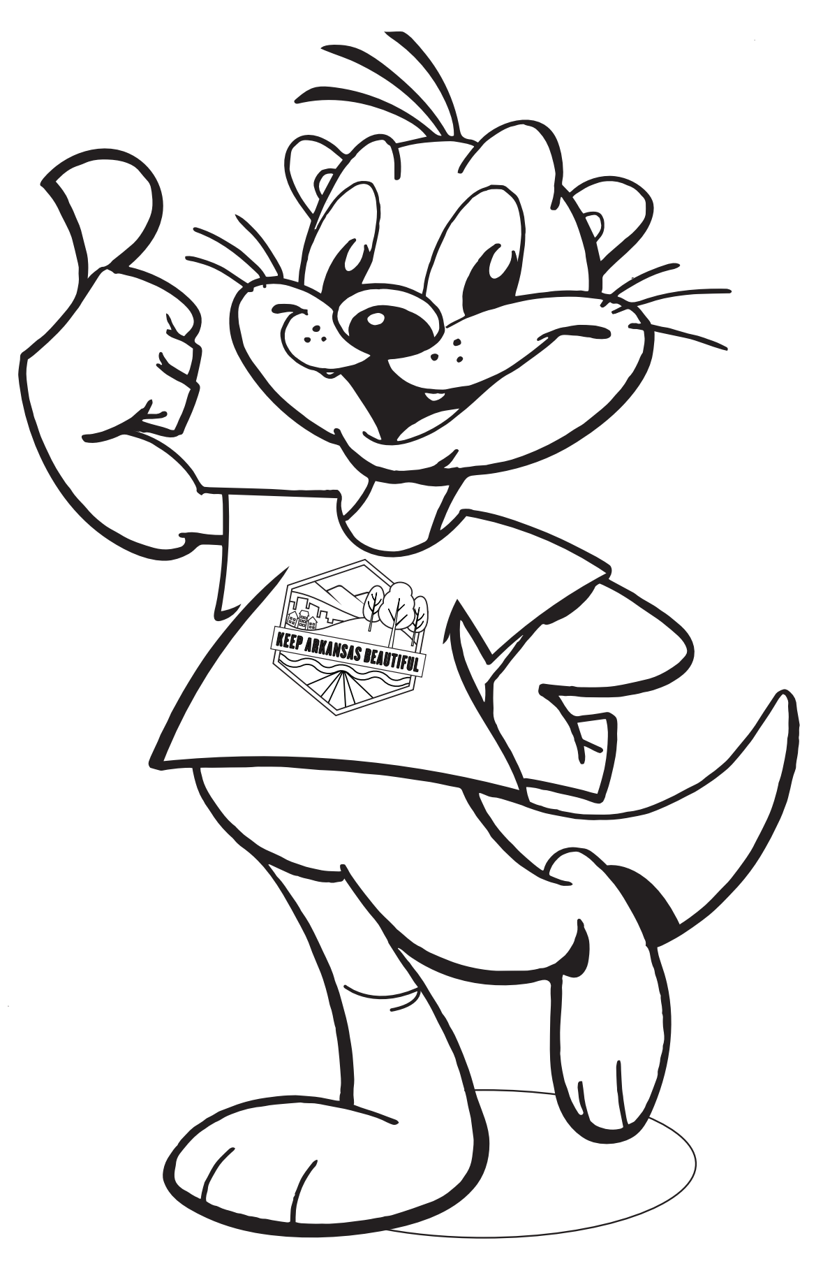
You "Otto" Keep Arkansas Beautiful. Don't Litter!