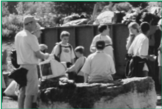
Beaver Lake cleanup, Sept. 27