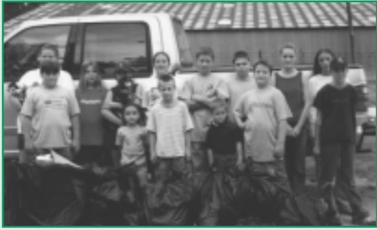
Lafayette County cleanup volunteers