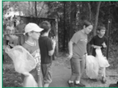
Franklin County cleanup at Fisherman's Bridge