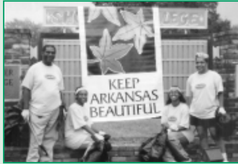
Pulaski County cleanup at Shorter College